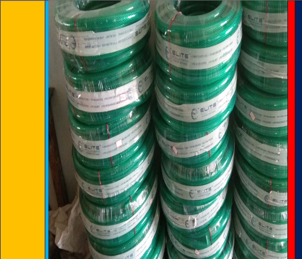
SANDHYAFLEX SANDHYAFEX SANDHYAFLEX SANDHYFLEX SANDHYAFLEX SANDHYAFES