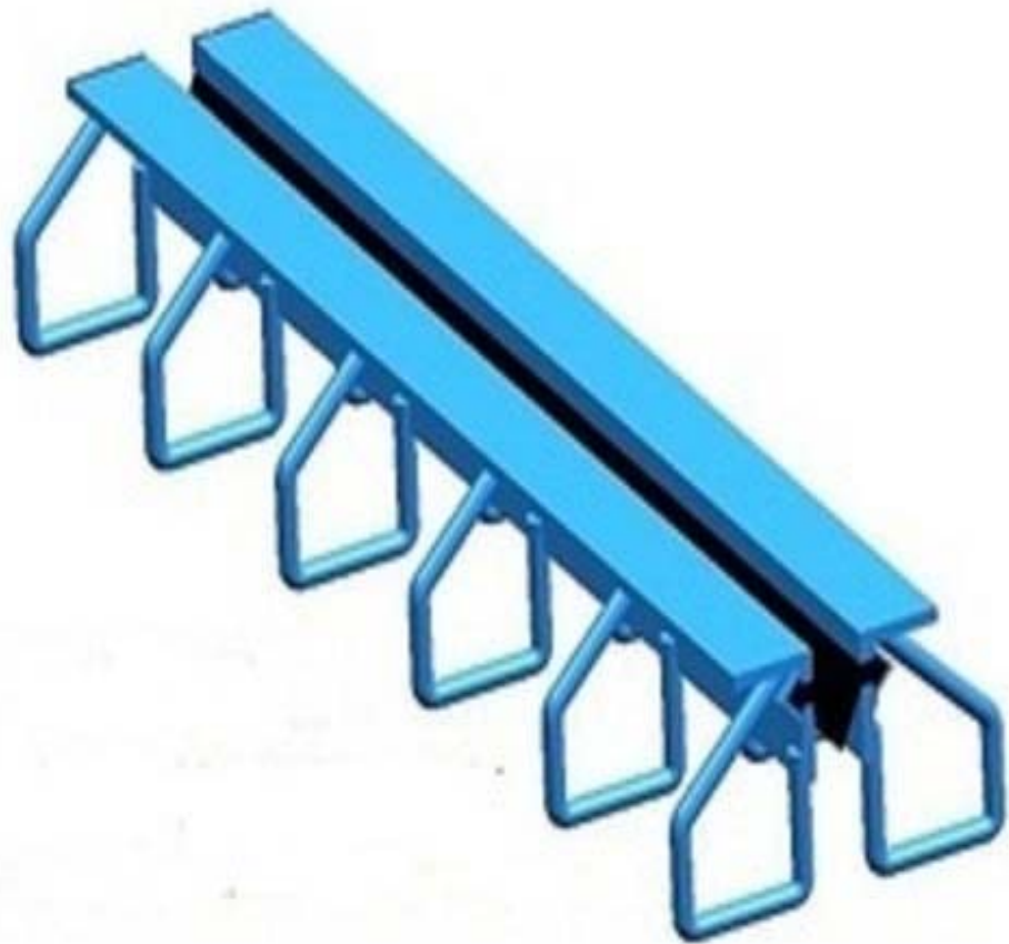
SANDHYFLEX STRIPS SEAL EXPANSION JOINT