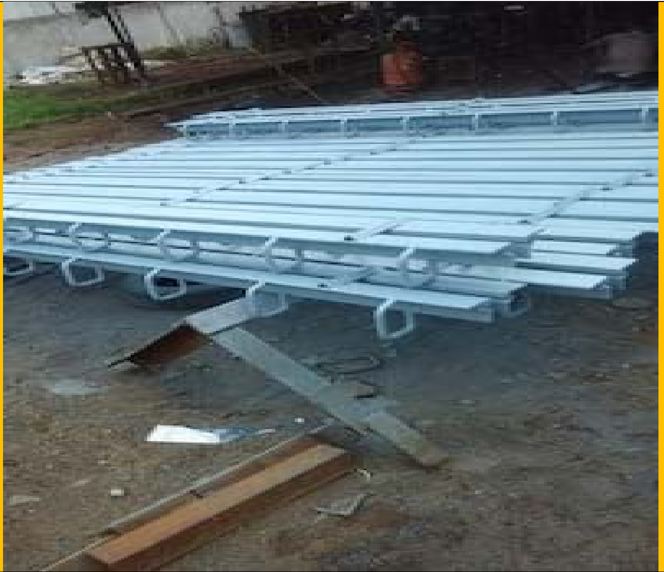
SANDHYAFLEX STRIP SEAL EXPANSION JOINT